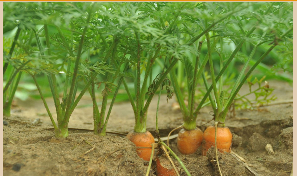
(Carrots in Israel)

“Sing praises to the Lord, O you faithful ones, and give thanks to Gods holy name!” -Psalm 30:4